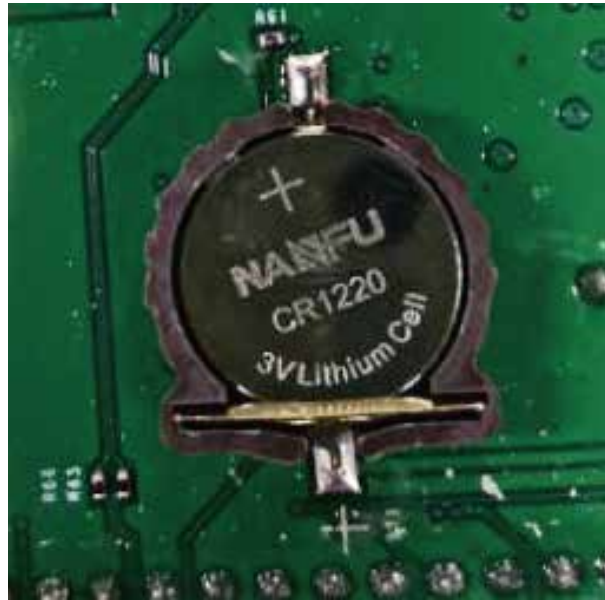
Figure 9-5 CR1220 Battery installed in DDCS-Expert

4) We install the CR1220 to the holder carefully: