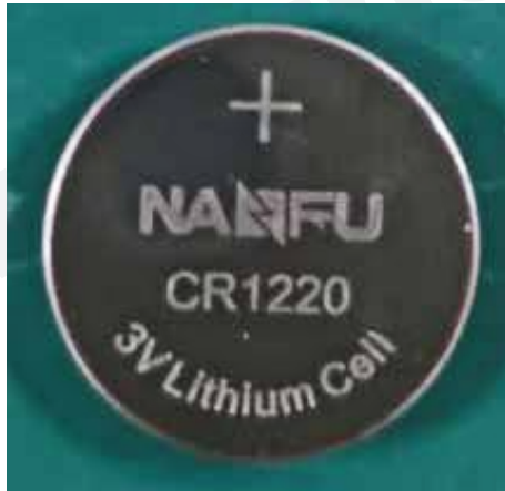
Figure 9-4 CR1220 Battery

3) Now we go to any local shop to buy the battery “CR1220”, here this picture is the battery we installed in our factory: